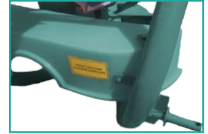
Kačenje u tri tačke Three-point coupling