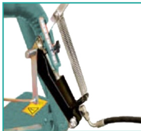
Uljani hidraulični pogon Oil hydraulic drive