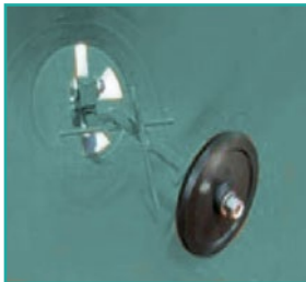
Artikulisani mešač Articulated agitator