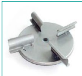
Disk od nerđajućeg čelika Stainless steel spreading disc