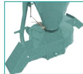
Dupli konvejer đubriva Dual fertilizer conveyor