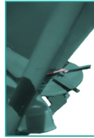
Rotacioni disk Rotation disc