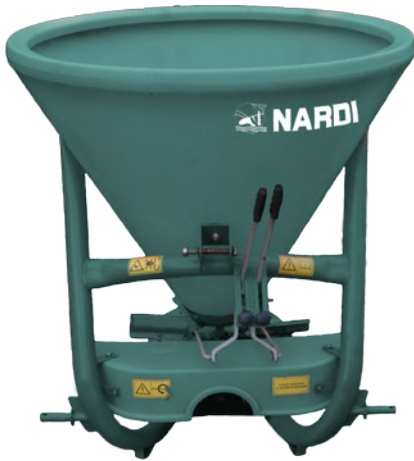
SP model sa plastičnim rezervoarom SP model with plastic tank