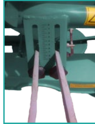
Kontrola toka Flow control