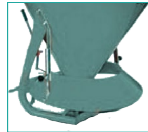
Deflektor za so/pesak Deflector for salt/sand