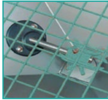
Standardna mreža za filtriranje sa rotirajućim mešačem Standard filtering grids with an ultra-slow rotating agitator