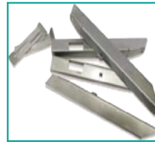
Lopaticice za rasipanje do 36m Vanes for spreading up to 36m