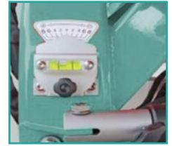
Regulator za kasnije rasipanje Tilt regulator for late spreading