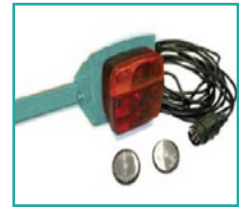
Zadnja svjetla Tail lights