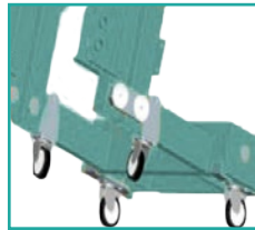
Kolica za parkiranje Parking wheels