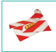
Oprema za sigurnost na putu Road safety equipment