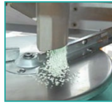
Kontrolisano sipanje đubriva na disk Controlled descent of fertilizer onto spreading disc